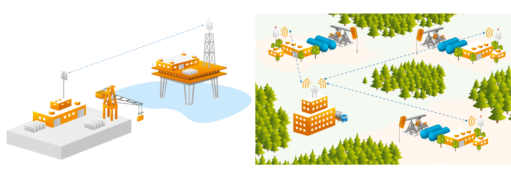
Figure 2 Energy and natural resources infrastructures

The backhaul represents the infrastructure that ensures the transmission of information between all the locations of a company. The scope is to connect the branch offices with the HQ and data center by ensuring the necessary quality of services (QoS) and the settled Service Layer agreements. This is valid for regional expansions between the different locations, as in case of longer distances the backhaul represents the connection from the local offices up to a high speed backbone (or core network) that can ensure a fast data transmission over large geographical areas. In addition to the typical Enterprise infrastructure, this document also addresses to corporations that operate in the energy and natural resources fields.